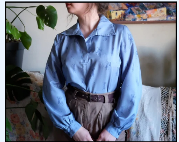
I mostly wanted to look for men's golf fashion, but wanted to include this blouse for just $50 when I saw that the producer was in Ukraine .

up with two different lists, Ebay's algorithm recognizes that they are the same items.