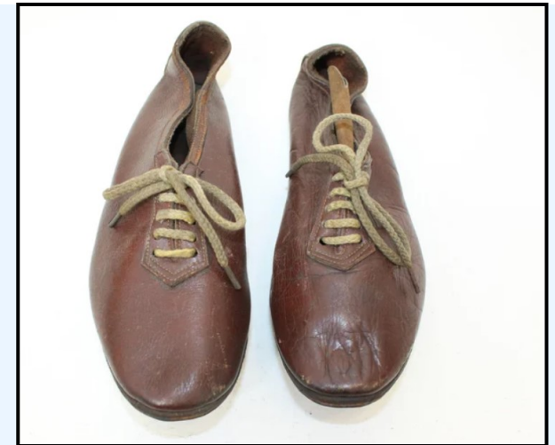
These vintage size 8 1/2 men's cleats sell for just $96 found on Etsy

online retailers. It's not very precise, and you have to open each to see the size, but it links to many more items than any other single site. Of note: I searched for underwear and then boxers and it came