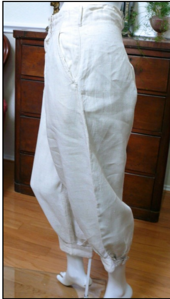
Nice pair of knickers available on Ebay , have a 28 inch waistline, but currently priced at $192.

Gem.app is a convenient way to window shop for vintage clothing from various