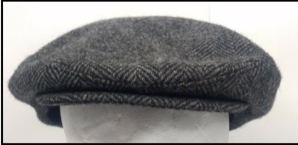
Ebay has this grey tweed cabbie hat for $25