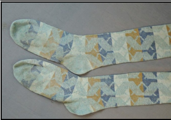
Dandelionvintage.com has this pair of high socks , meant to be worn with knickers, for $45

I found lots of retro looking dress shoes, but athletic shoes look far more authentic, so when I found some cleats, I looked to create a full golfer's wardrobe.