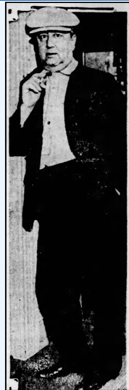
Judge Francis Borrelli

Borrelli and Bundesen were both nationally famous and could easily have been used to give the story credence. The lack of detail, duplication of this story in other newspapers, and similar crimes committed during the Depression, makes me suspect its veracity.